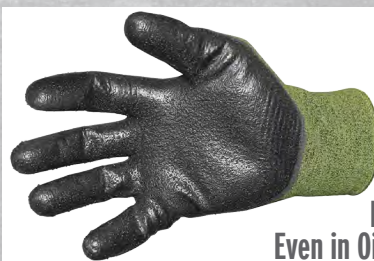
Excellent Grip Even in Oily Conditions